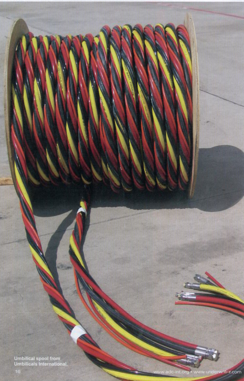
Umbilical spool from Umbilicals International.

There are several different ways that the umbilicals can be physically put together. The first is the straight, or non-twisted, umbilical. This is a common set up where the pneumo